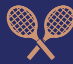
Squash & Tennis Court