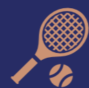
Padel Tennis Court